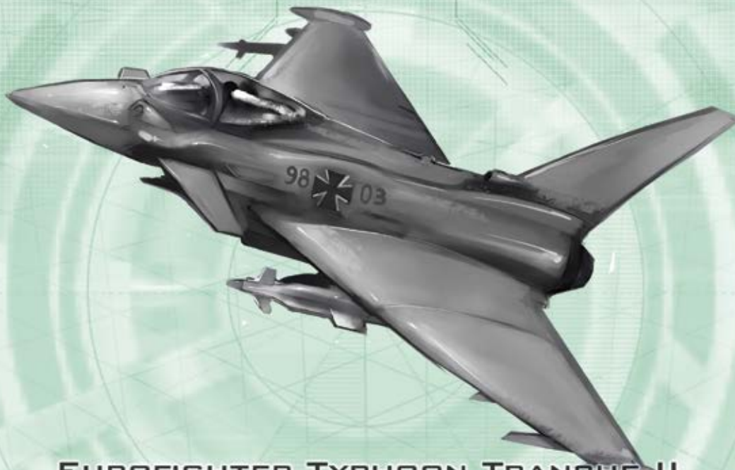
EUROFIGHTER TYPHOON TRANCHE II