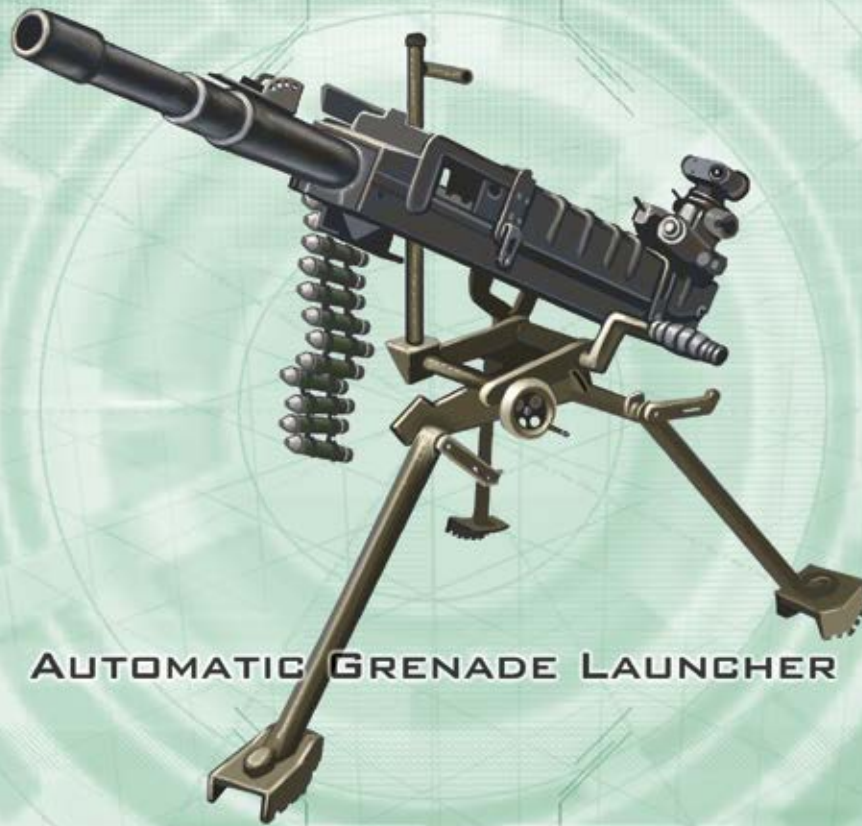
AUTOMATIC GRENADE LAUNCHER