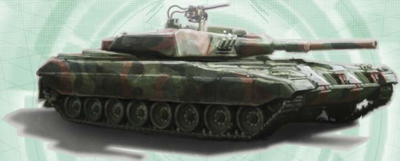
RUHRMETALL KMA7-C LEOPARD