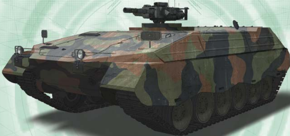
MARDER IV APC