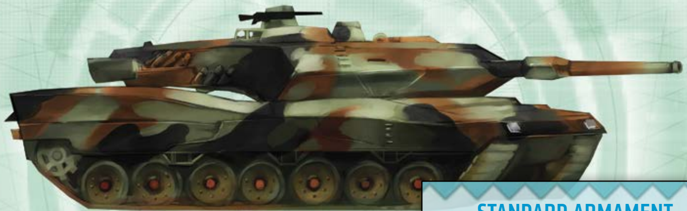
LEOPARD 2A8 TANK